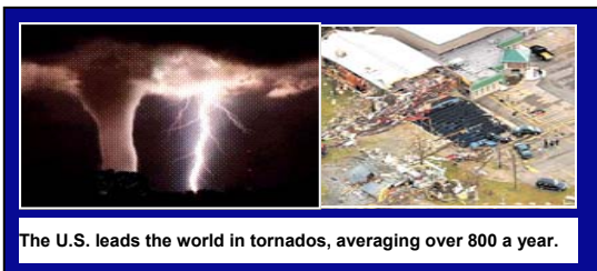
The U.S. leads the world in tornados, averaging over 800 a year.

Your local health district is working with national, state, and local governments and civic agencies to develop and coordinate disaster response to a variety of different hazards, ranging from natural disasters to explosive, nuclear, biological, and chemical terrorism. Volunteers are desperately needed to provide assistance and depth to our existing response teams.